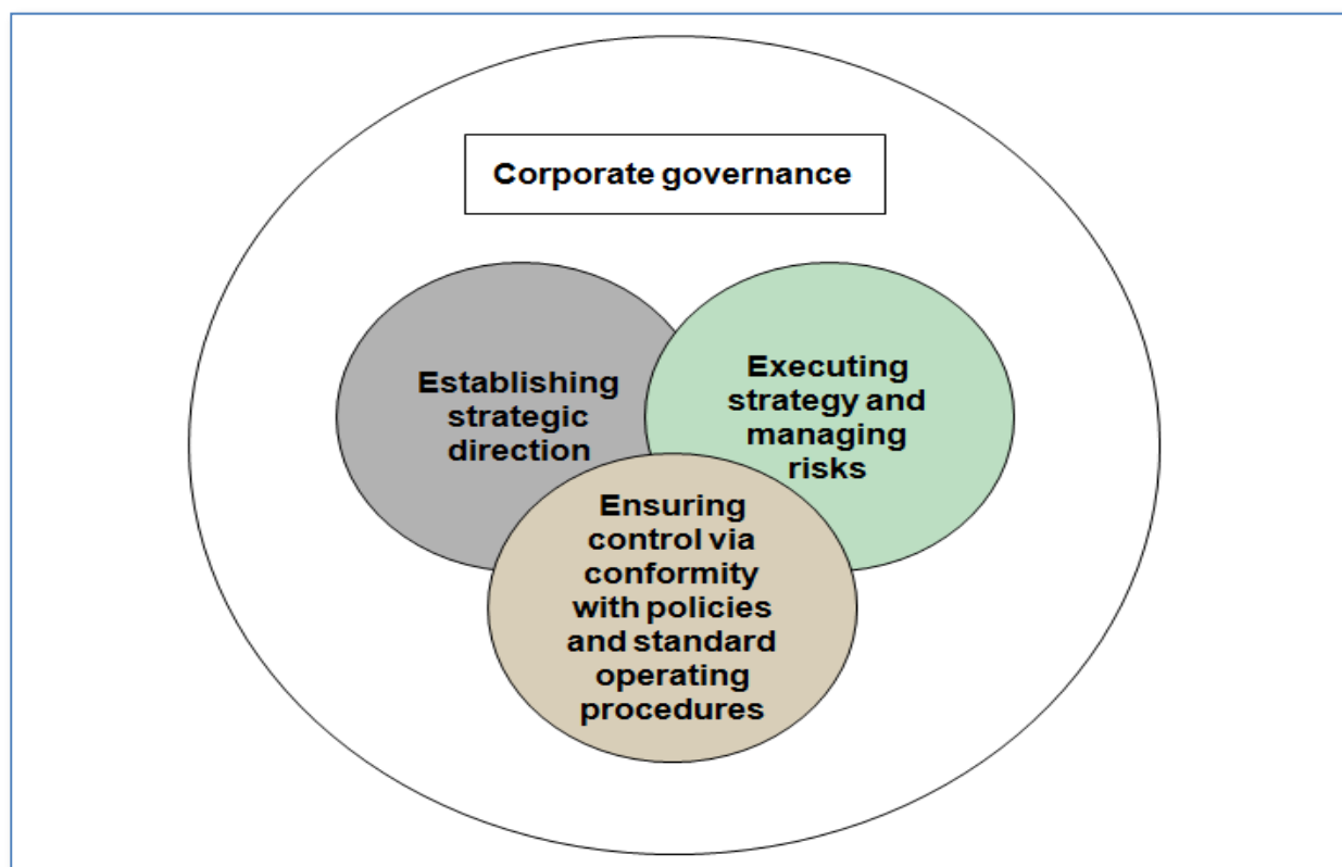
Exhibit A: Corporate governance in brief

Corporate governance is the system of rules, practices and processes by which a bank is directed and controlled. Corporate governance essentially involves fair treatment and balancing the interests of the many stakeholders in a bank - these include its shareholders, management, employees, customers, suppliers, financiers, the government (including regulatory entities such as SAMA, CMA, and MC, etc.) and the community.